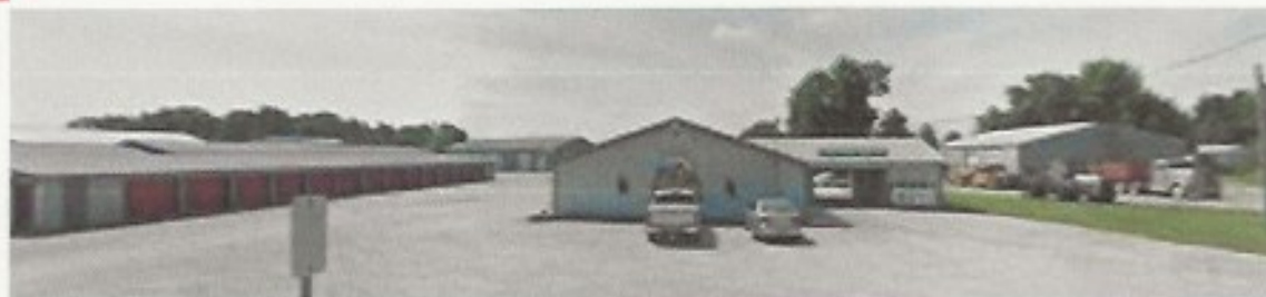
Farmer's Family Restaurant Mt. Pulaski